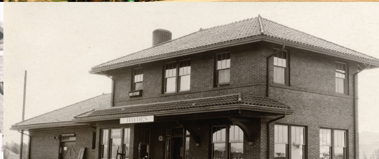
Top photo: courtesy Tammie Delaney; bottom photo: courtesy Tracks & Trails Museum